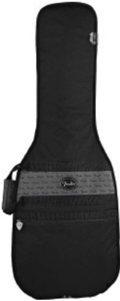
Fender 3/4 Size Acoustic Gig Bag

Fender's popular gig bags are a durable and space-saving way to get where you're going while keeping your instrument free of dings and dents. This heavy-duty nylon gig bag is perfect for you or your little rocker, whether you're heading to rehearsal or about to hit the stage. It features plenty of comfortable appointments to make travel a breeze, including a easy-grip handle, adjustable shoulder straps and more.