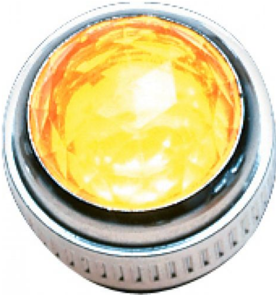
Fender Amp Jewel, Amber