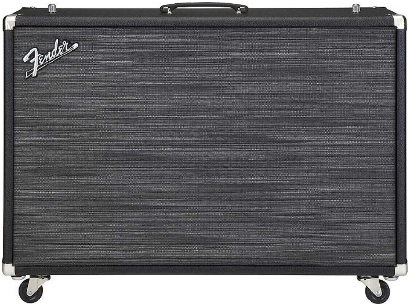
Fender Super-Sonic 212 Enclosure (Black/Pepper)

Possibly the last one available with factory warranty and pepper grille cloth. This is the floor model, with full two year warranty.