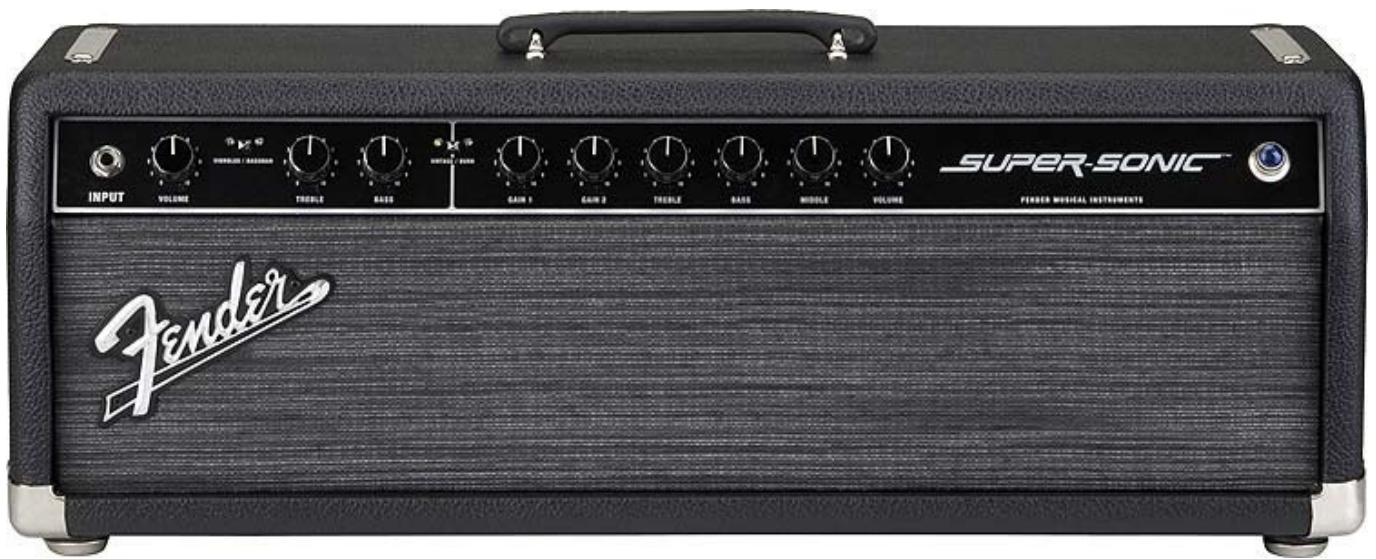
Fender Super-Sonic 60 Head (Black/Pepper)

Possibly the last one available with factory warranty. This is the floor model, with two year warranty.