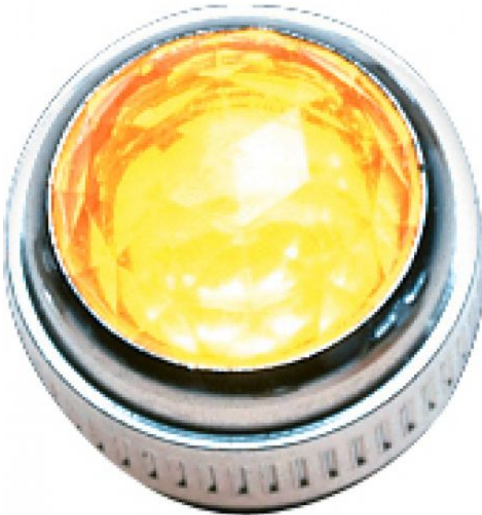
Fender Amp Jewel, Amber