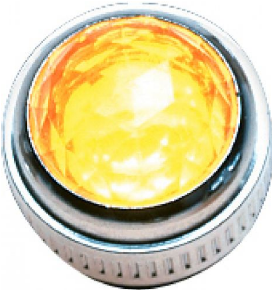
Fender Amp Jewel, Amber