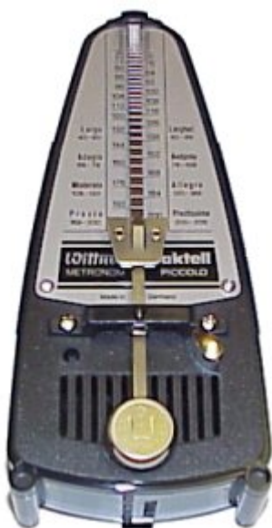
Wind-up Metronome, Black, 836