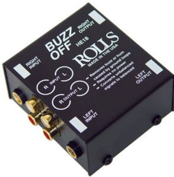
Rolls HE18 Buzz Off