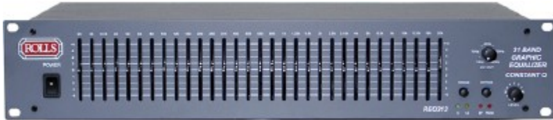
Rolls REQ313 Constant Q Graphic Equalizer