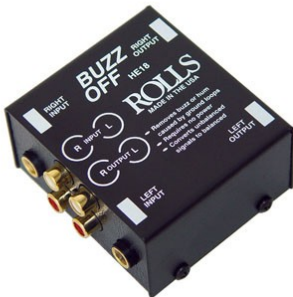
Rolls HE18 Buzz Off