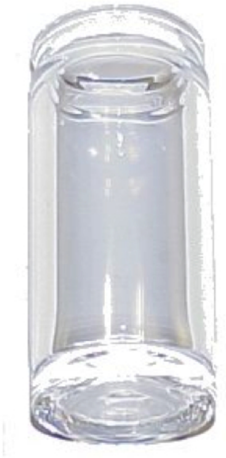
Blues Bottle Glass Slide, Heavy Wall, Small

The Blues Bottle® slide will take you back to pre- Depression Mississippi, where Blues Masters used medicine-bottle slides to form the roots of modern day blues. Blues Bottle® slides are individually hand blown of durable, seamless Pyrex glass for a crisp, bright tone. The weighted, closed ends provide optimum balance.