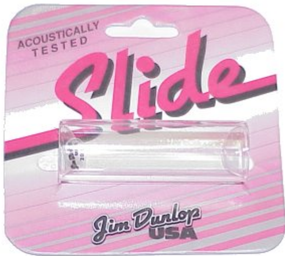
Pyrex Glass Slide, Regular Wall, Medium

Dunlop Tempered Glass Slides offer a warmer, thicker tone accentuating the middle harmonics of your sound. Processed from high quality boron silicate. Heat treated and annealed for a flawless tube.