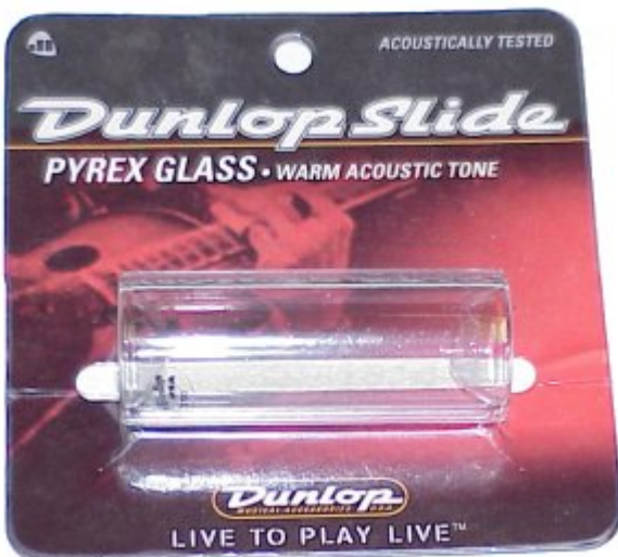
Pyrex Glass Slide, Medium Wall, Medium

Dunlop Tempered Glass Slides offer a warmer, thicker tone accentuating the middle harmonics of your sound. Processed from high quality boron silicate. Heat treated and annealed for a flawless tube.