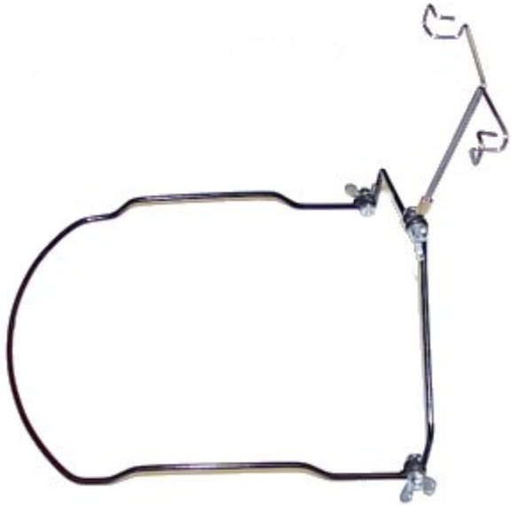
Harp Handle HH1

Lightweight harmonica holder featuring a stainless-steel holding clip and comfortably contoured harness Fits all 10- to 14-hole harmonicas Design allows for easy height and angle adjustments