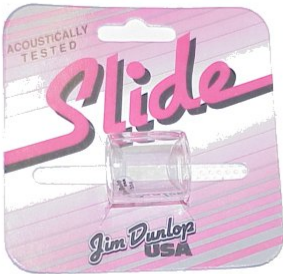
Pyrex Glass Slide, Short Knuckle

Dunlop Tempered Glass Slides offer a warmer, thicker tone accentuating the middle harmonics of your sound. Processed from high quality boron silicate. Heat treated and annealed for a flawless tube.