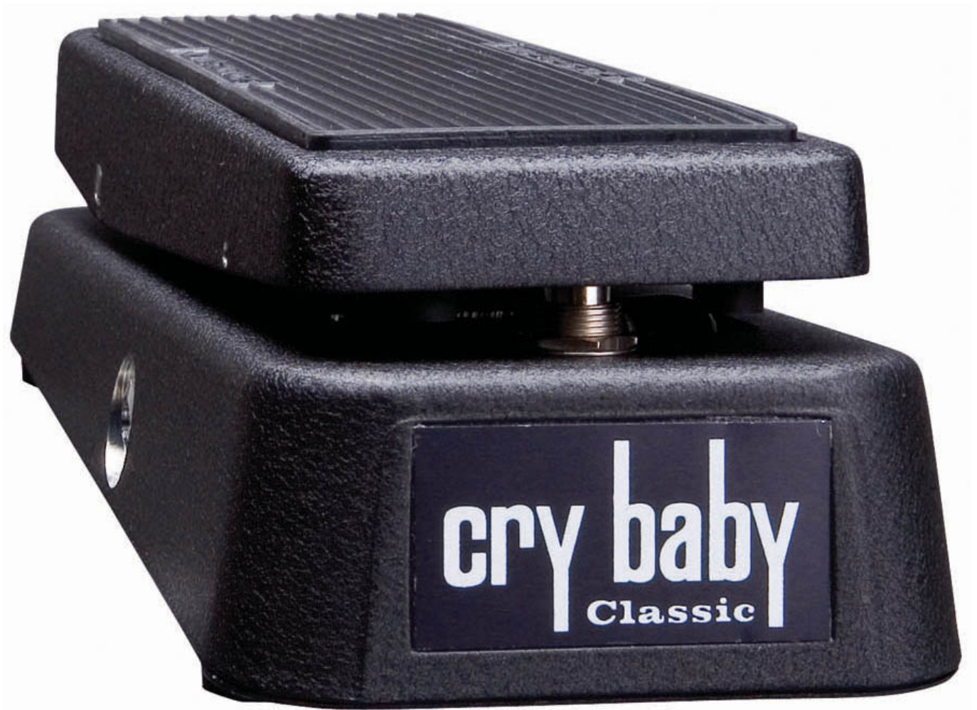
Cry Baby® Wah Wah