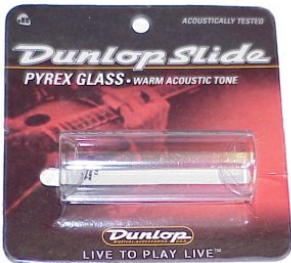
Pyrex Glass Slide, Regular Wall, Large

Dunlop Tempered Glass Slides offer a warmer, thicker tone accentuating the middle harmonics of your sound. Processed from high quality boron silicate. Heat treated and annealed for a flawless tube.