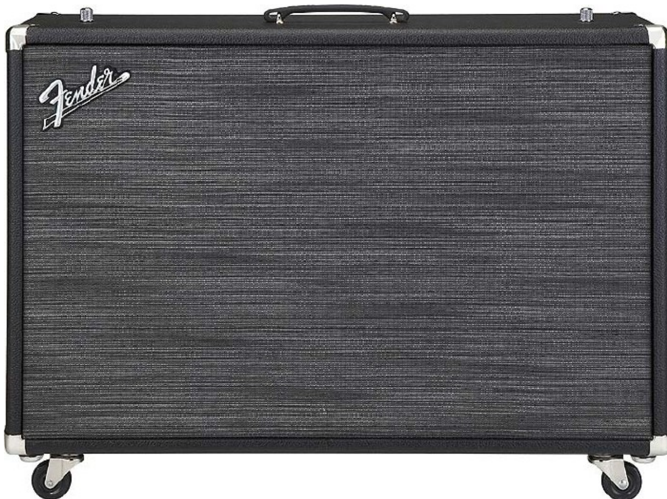
Fender Super-Sonic 212 Enclosure (Black/Pepper)

Possibly the last one available with factory warranty and pepper grille cloth. This is the floor model, with full two year warranty.