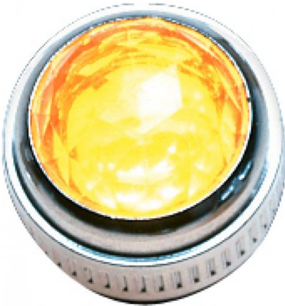
Fender Amp Jewel, Amber