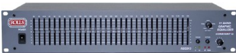
Rolls REQ313 Constant Q Graphic Equalizer